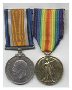
The Victory and British medals

He was awarded the Victory and British medals.