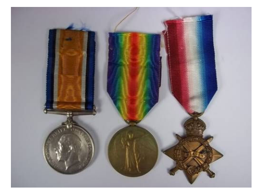
The Victory and British War Medals and the 15 Star.

As well as at Thiepval, he is commemorated on the Bleasdale and Calder Vale Memorials, on the memorial plaque to the Fallen erected by the Bleasdale Court of the Ancient Order of