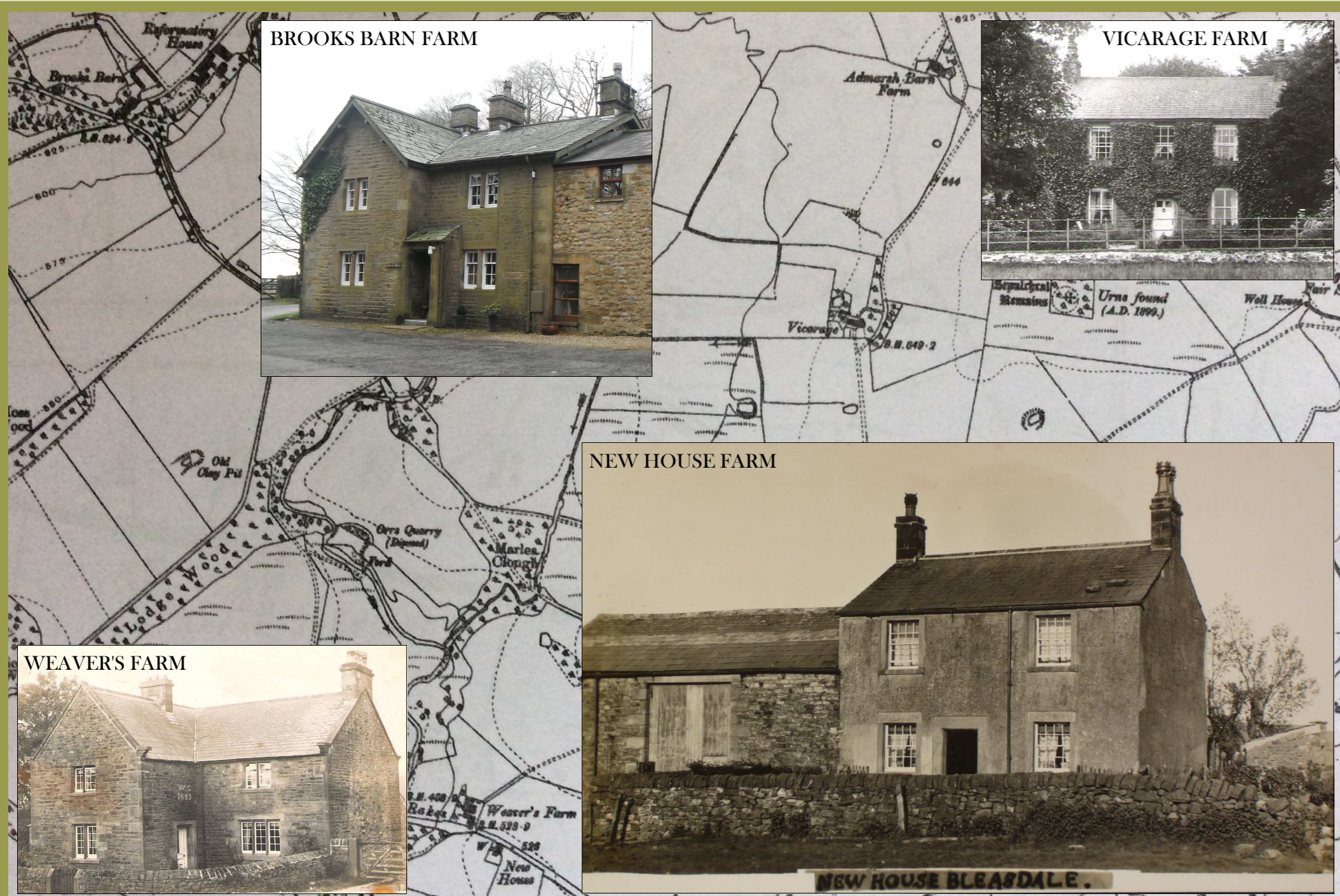
Preston Guardian 27th March 1915

Preston Guardian 17th August 1918 FARM CROPS SUCCESSES IN COUNTY COMPETITION JUDGE'S AWARDS FOR GARSTANG (EAST)