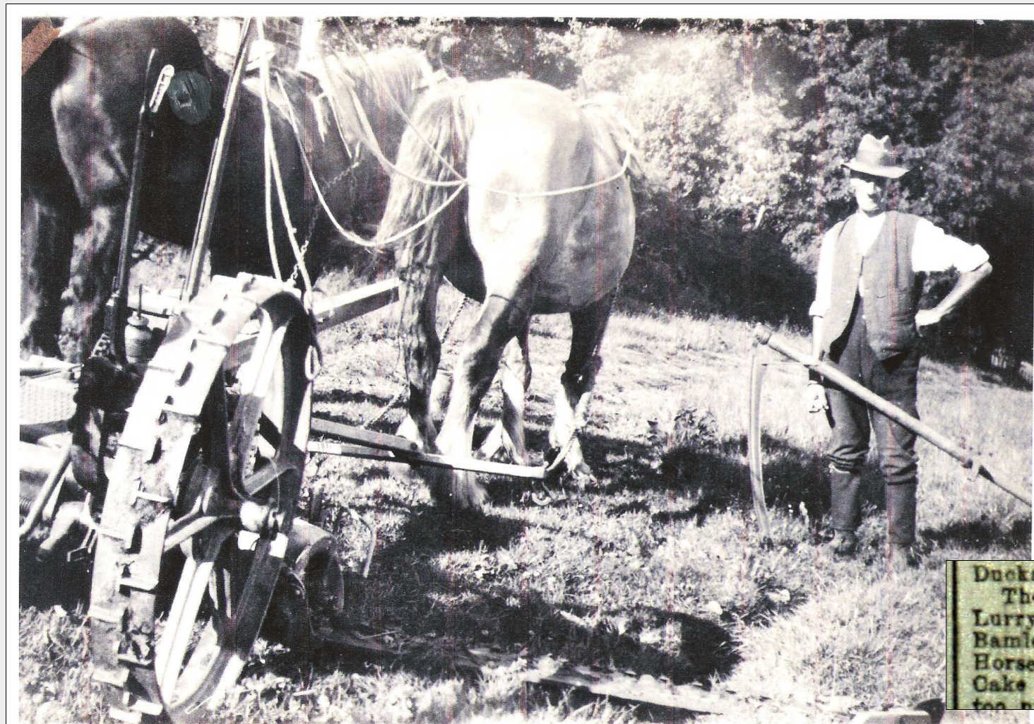
Two-horse Bamlett mowing machine at Hazelhurst Farm

gained second prize for his fields of oats.