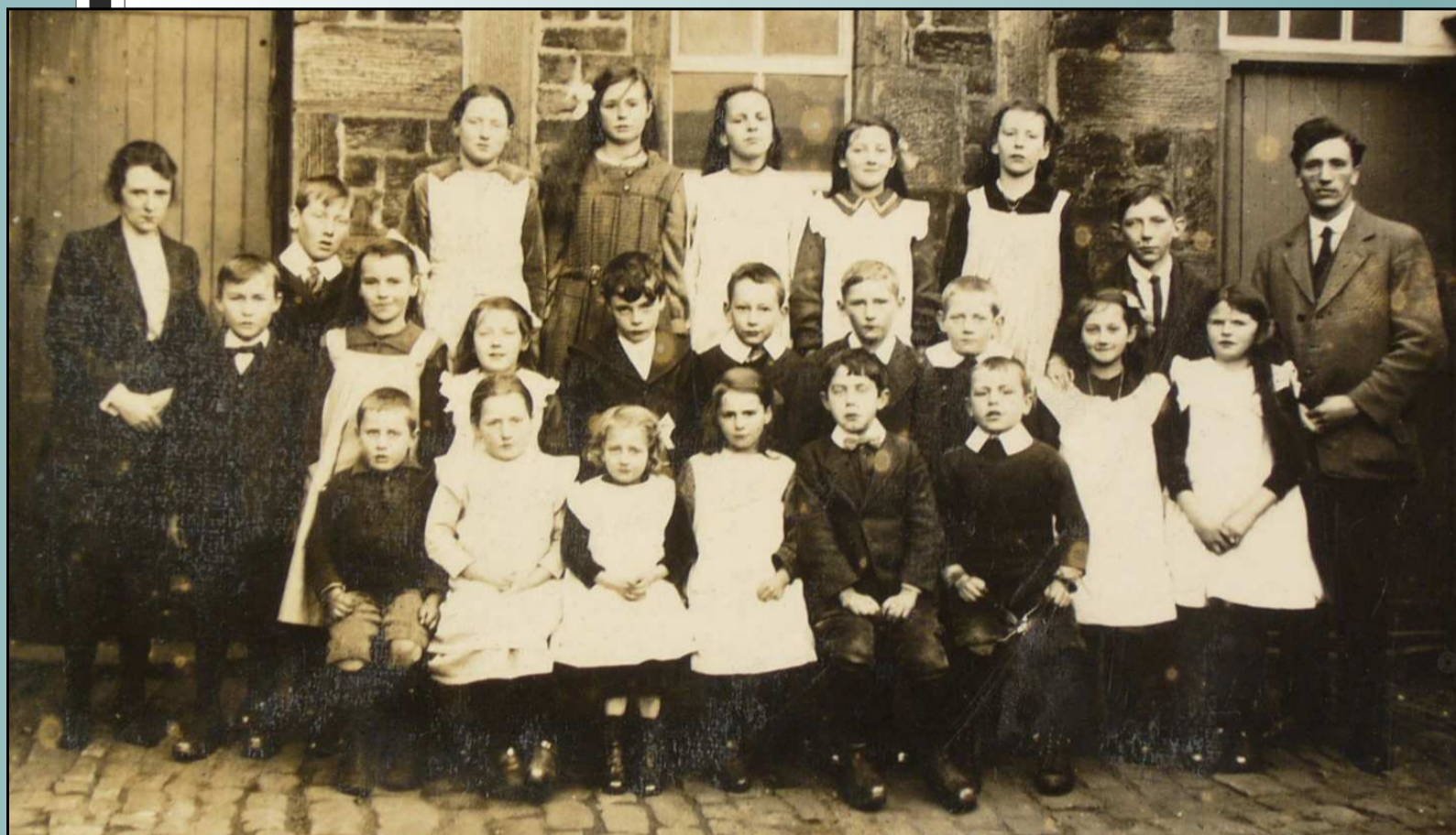
BLEASDALE SCHOOL AROUND WWI