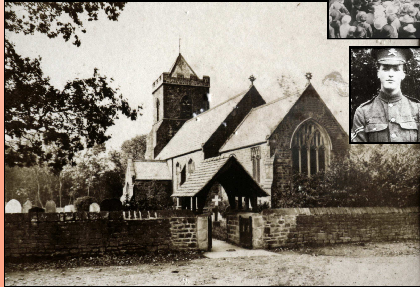
St John's, CALDER VALE