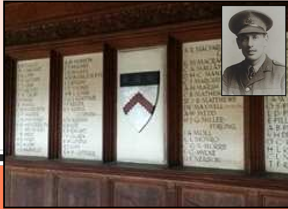
Keble College, OXFORD (Bourn)