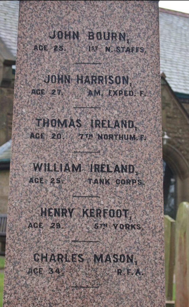
St James', WHITECHAPEL