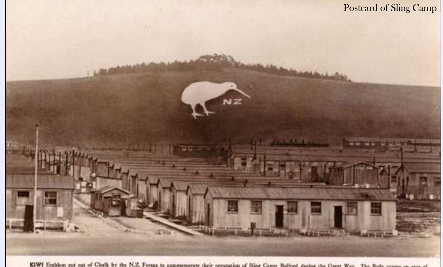
KIWI Emblem out out of Chalk by the N.Z. Forces to commemorate their occupation of Sling Camp, Bulford, during the Great War. The Body covers an are area, Height 420 ft., length of Bill 150 ft. Height of letters N.Z. 65 ft. Total area enclored 4) acres. The Emd lem has been registered as a Military Eneroushe the Imperial Authorities and on behalf of the N.Z. Forces, its maintenance has been undertaken by the KIWI PULSH CO., Pty. Ltd., London.

He then moved to NORTH ISLAND Trentham Military training WELLINGTON camp near Wellington, North SOUTH SLAND Island and 3 months later left NZ on the troop ship 'Maunganui' bound for England and the New Zealanders' training camp at Sling, n Salisbury Plain. He returned there at the nd of the war to be demobilised and was Sling when the Kiwi was carved.