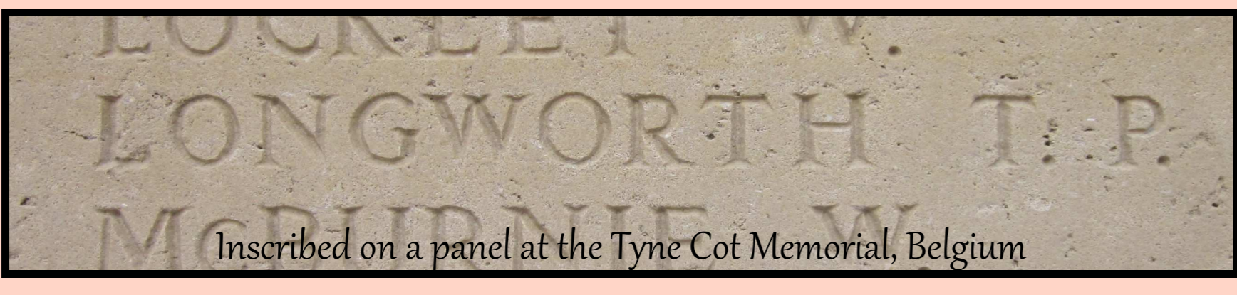
Inscribed on a panel at the Tyne Cot Memorial, Belgium

The blacksmith would have sharpened and repaired tools and equipment for the hundreds of men working on the site.